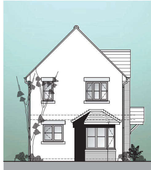
SIDE ELEVATION (Street Elevation)