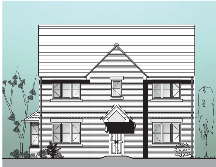
FRONT ELEVATION (Street Elevation)

PROPERTY MISDESCRIPTIONS ACT 1991 (Warning to House Purchasers) These drawings, and their contents, are for 'Construction' purposes only and may be subject to change at any time. Alterations and Variations may occur during the construction process, and therefore the layout, form, content, and dimensions of the completed construction may vary from that shown on these drawings. Every effort is made to constantly update the information shown however there may be situations of unavoidable delay due to changes in Statutory Regulations and/or re-planning. Purchasers are advised to check with the Sales Team to ascertain whether there have been any alterations to the printed information.